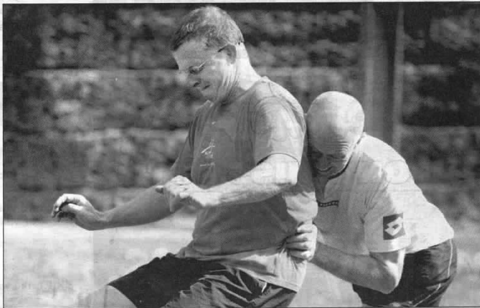
Getting fit: office workers do some resistance training.

"It is a really good team-building exercise," he said.